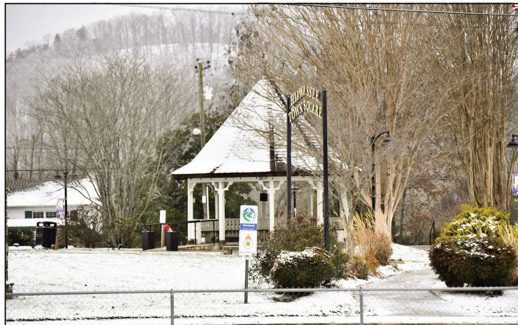
The Hiawassee Town Square got about as much snow as the rest of the county over the weekend, about an inch or so with isolated areas of higher snow totals.