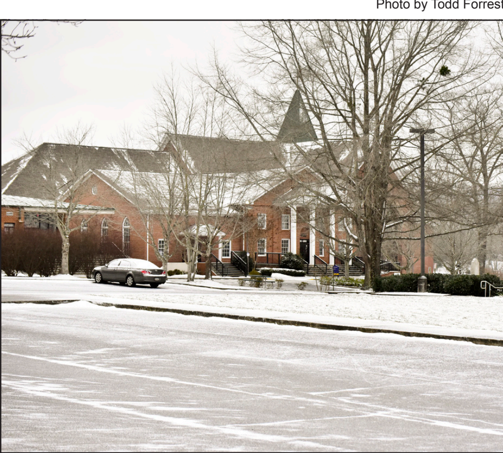
McConnell Memorial Baptist Church in the snow Monday morning.