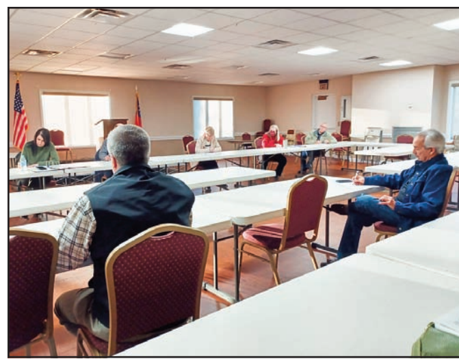
The Towns County Convention and Visitors Bureau Board welcomed the public to the Civic Center on Tuesday, Jan. 11.