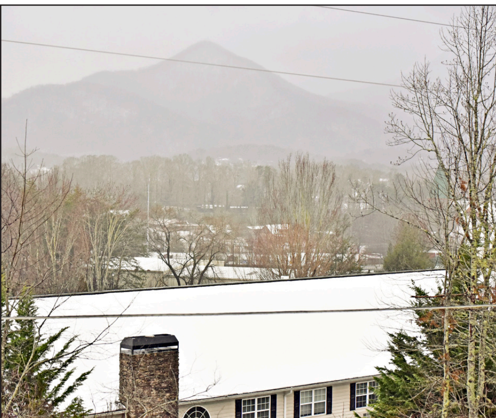
A view of Hiawassee from above Brasstown Manor Sunday morning.