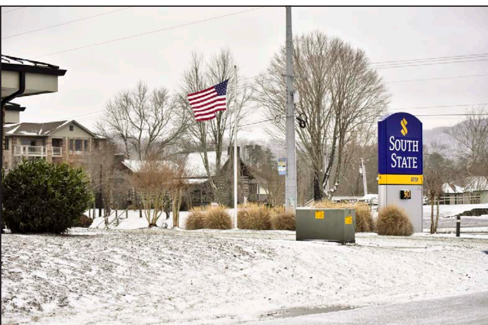
Like many places, SouthState Bank was closed in observance of Martin Luther King Jr. Day, though the weather may have been enough to have resulted in closure anyway.