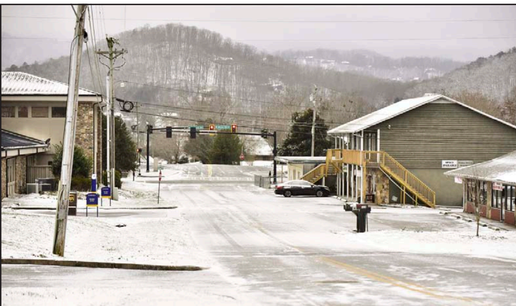
Towns County was fortunate to have been spared a major snow event, though plenty of side roads were slick enough to keep many people home Monday morning.

Towns County Schools announced Monday that, due to inclement weather, students in the system would be having an online learning day for Tuesday, Jan. 18.